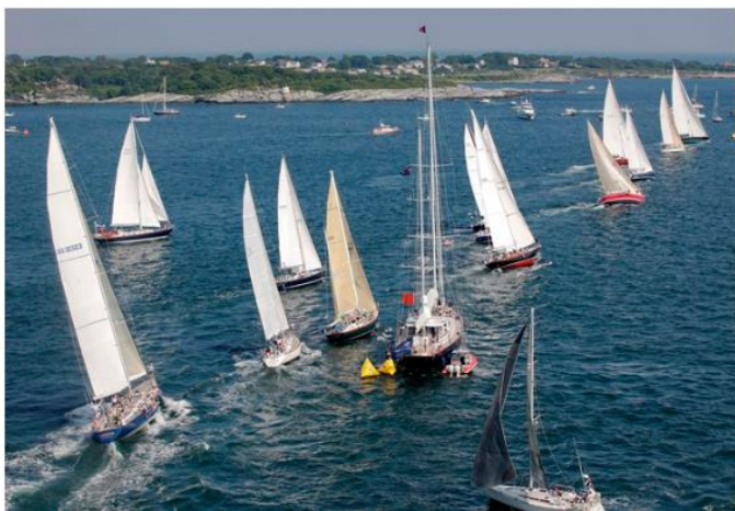
Rear Commodore Kevin Ingle