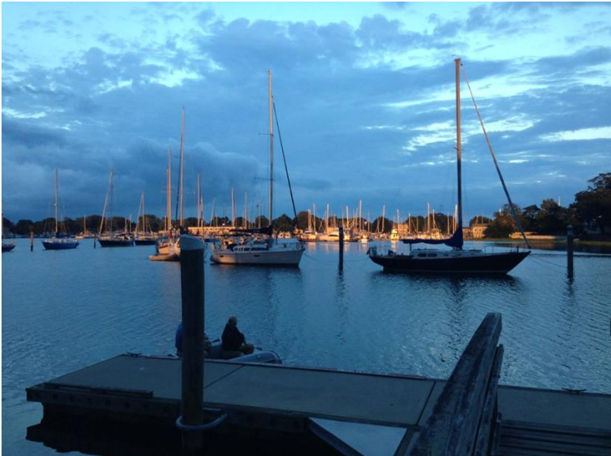
View from the dock - Photo courtesy of David Lodge

http://www.westbayyachtclub.org/wbyc-club-calendar.html