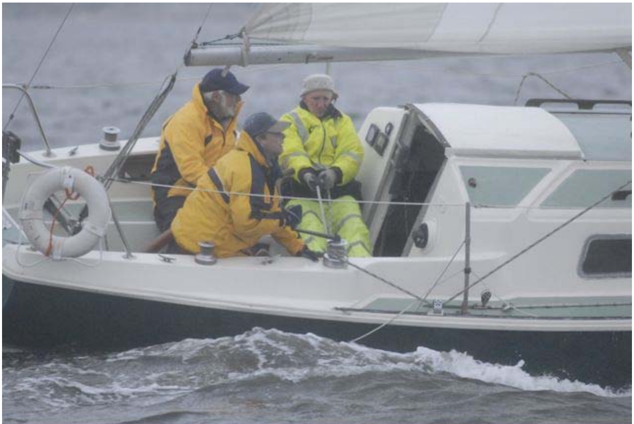
All sailing photographs are courtesy of Jim Wright