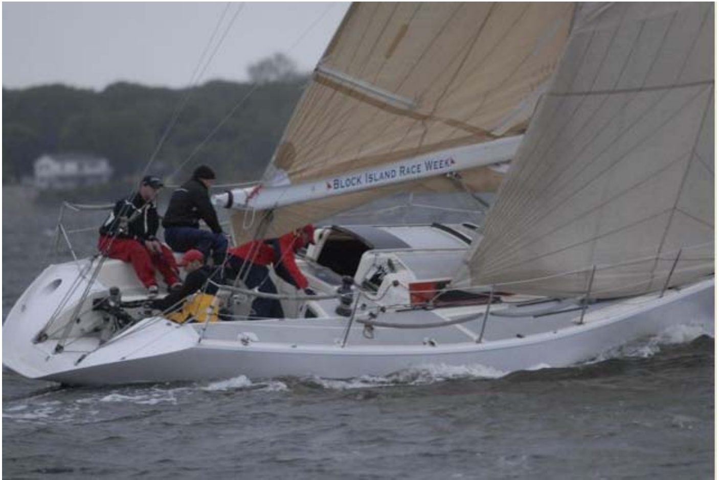
All sailing photographs are courtesy of Jim Wright

Need something we don't have in stock? Our professional & knowledgeable staff will be happy to order it for you. Just give us a call or email us your requests. We have next day delivery on most special orders.