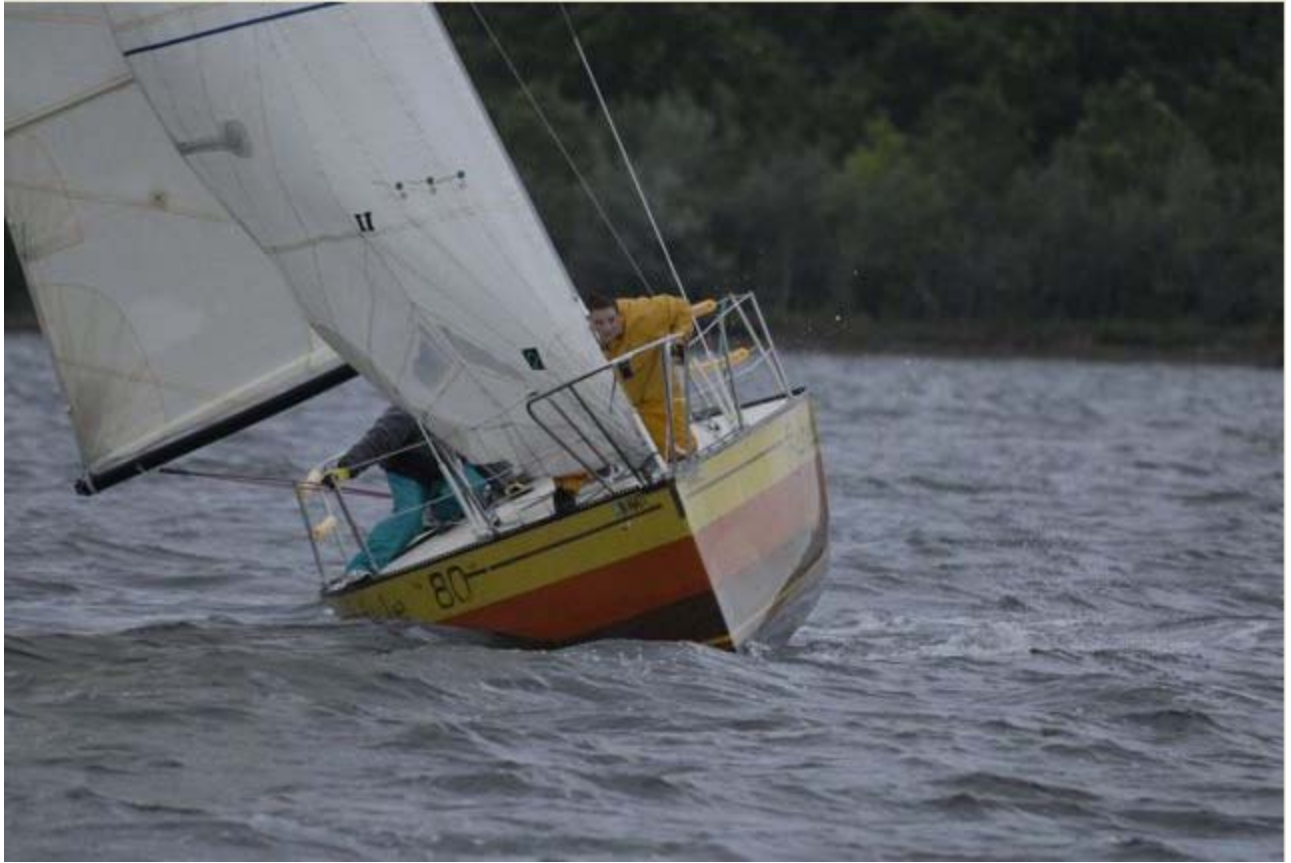
All sailing photographs are courtesy of Jim Wright