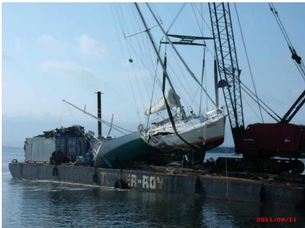
Irene Damage