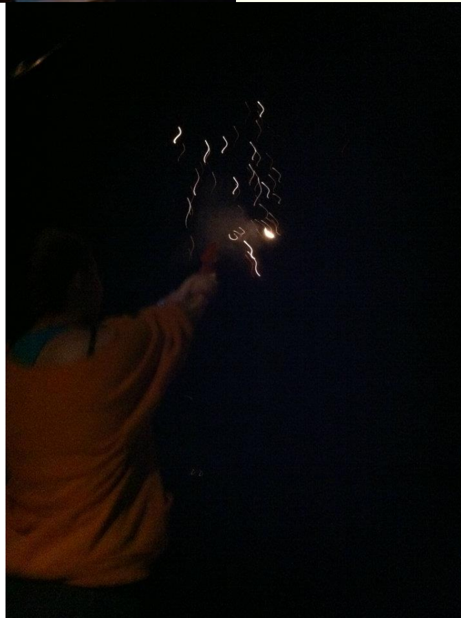
Sea Scouts Flare Demonstration 9/20/2011