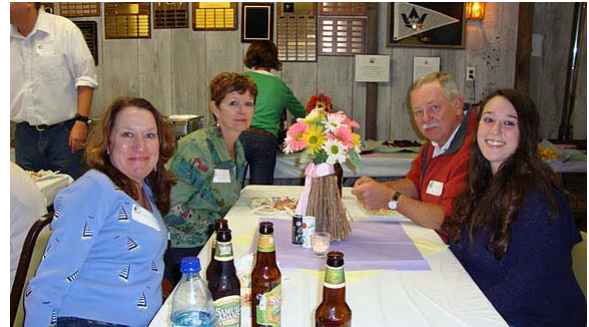
Make new friends but keep the old, one is silver and the other gold...