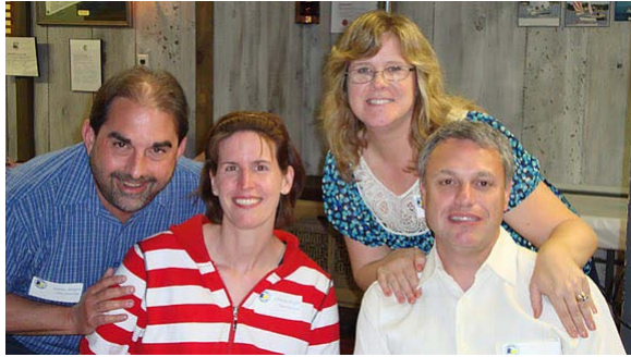
A big "Welcome" to new members!