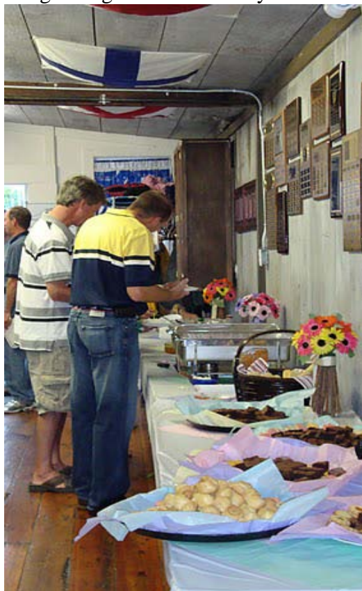
Everyone enjoyed the delicious buffet