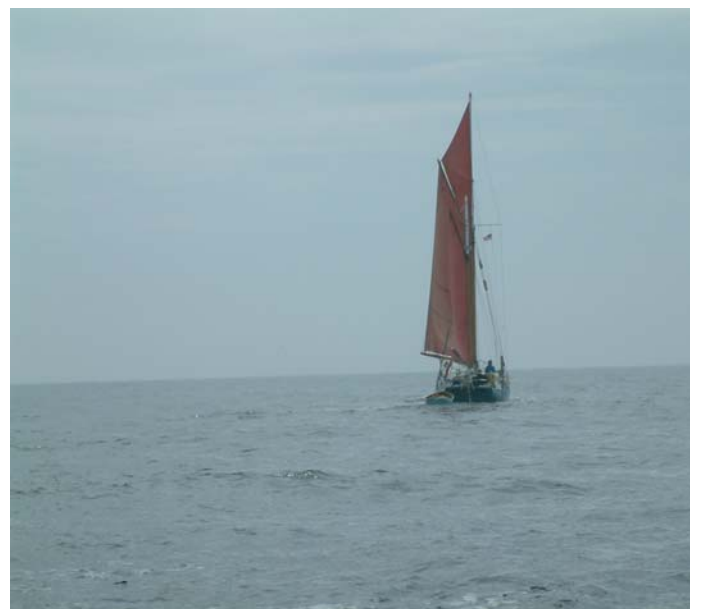
Summer will return soon...