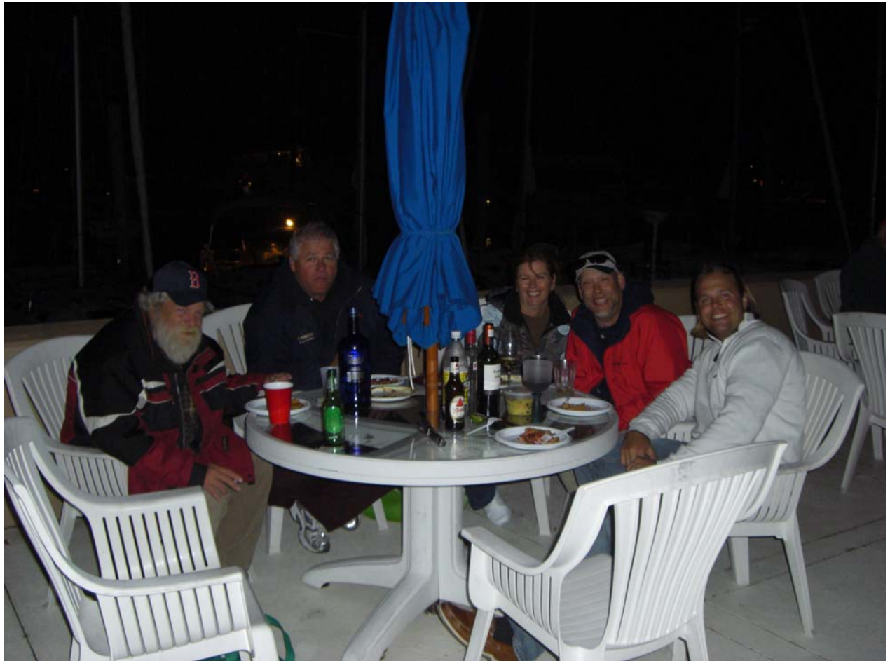
A late night crew enjoying the Wickford cruise