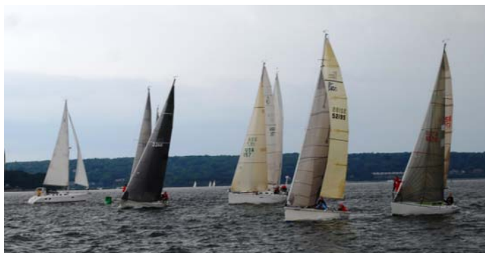
Recent WBYC Racing Action