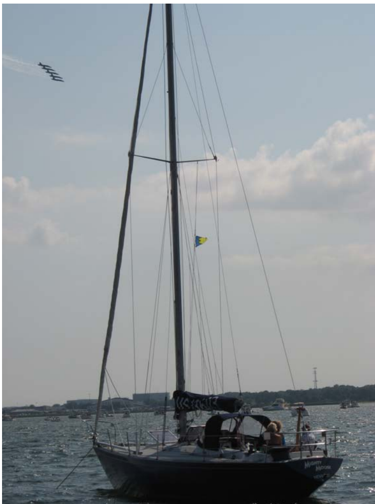
The crew of Mighty Moose enjoys the Blue Angels at the RI Air Show

Note: Submit new and renewal ads to willrichmond@gmail.com . Ads will run for three months. (Expiration date on end of each ad). Please limit ad to 75 words or less