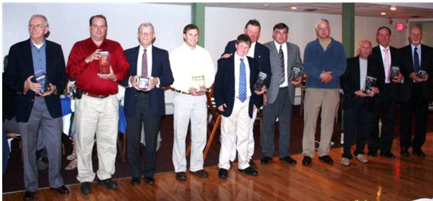
Fall Series Award Winners