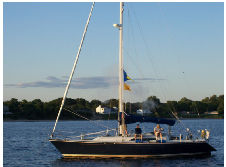
Won't be long now!

PO Box 1604 East Greenwich, RI 02818 http://www.westbayyc.org